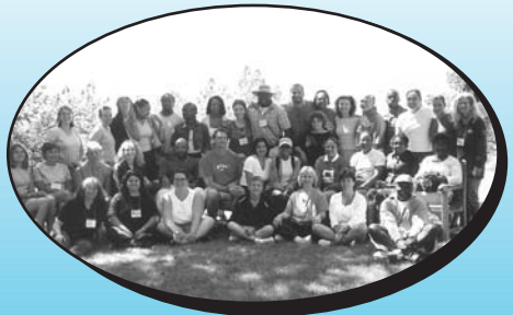
TISHE 2002 Participants