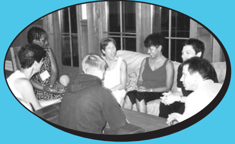
TISHE 2003 participants

This five-day training will feature modules on life-long sexuality, learner diversity, values clarification, giving and receiving feedback, and answering difficult questions. We will also provide smaller “how to teach about . . .” and content-focused workshops. In addition to the information that you receive throughout the training, you will get a valuable notebook of supporting articles and resources to use when you return to your school or agency.